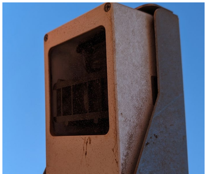
WEED-IT tractor console.