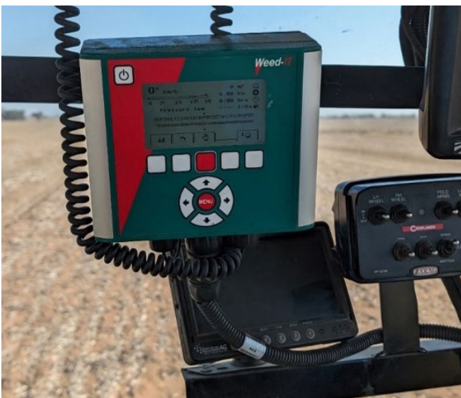
WEED-IT tractor console.

With the adoption of these more advanced systems, operational costs have increased due to the additional machine weight and reduced speed of operation compared with conventional booms. Costs rose from $1.72 per hectare with the conventional system to $2.72 and $2.29 per hectare for the Goldacres Ground Glider WEED-IT and Croplands Sonic WEED-IT respectively. Despite these increased per-unit costs, the large scale of the property (14,000ha) allowed repair and maintenance (R&M) costs to be spread over a wider area, mitigating some of the impact.