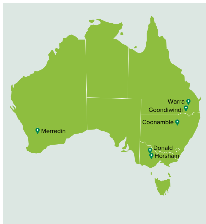
Figure 1: Location of case studies.

To explore technology uptake in different regions, the following GRDC regions were covered: