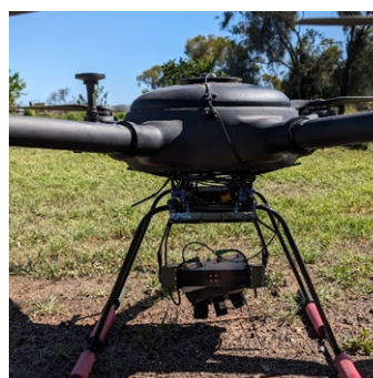
Single Shot drone with multiple cameras to reduce stubble shadowing.

The core of Single Shot technology is a high-capacity drone equipped with advanced sensors capable of mapping 1500 to 2000ha a day, even under adverse weather conditions. The drone operates at an optimal altitude of 80m, capturing imagery from various angles to minimise obstructions from stubble. It can reliably detect weeds as small as 3cm in diameter, enabling precise mapping and assessment of weed coverage in paddocks.