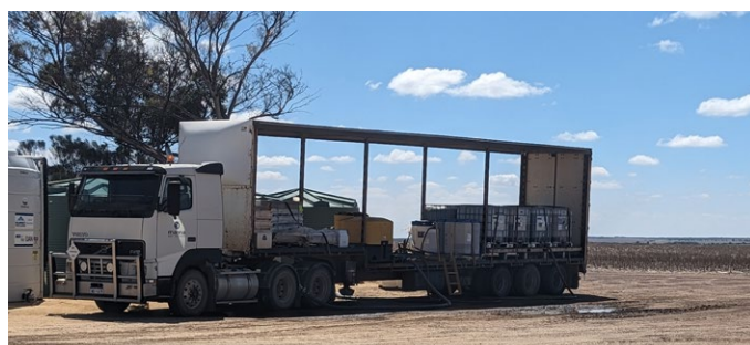
Batching truck with water tanks behind increases field efficiency at Merredin.