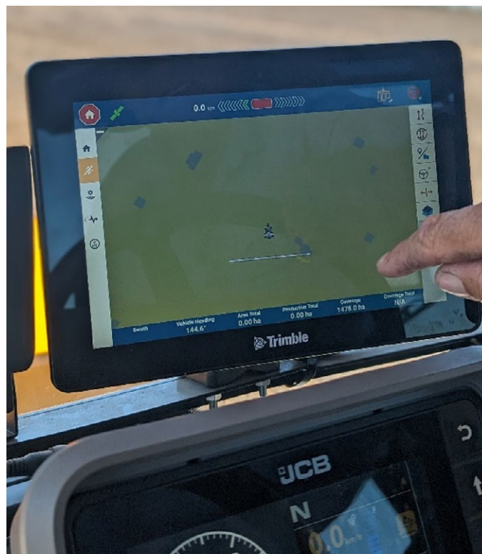
Trimble interface used with Single Shot technology.

The Single Shot system enabled the following improvements, which enhanced operational efficiency.