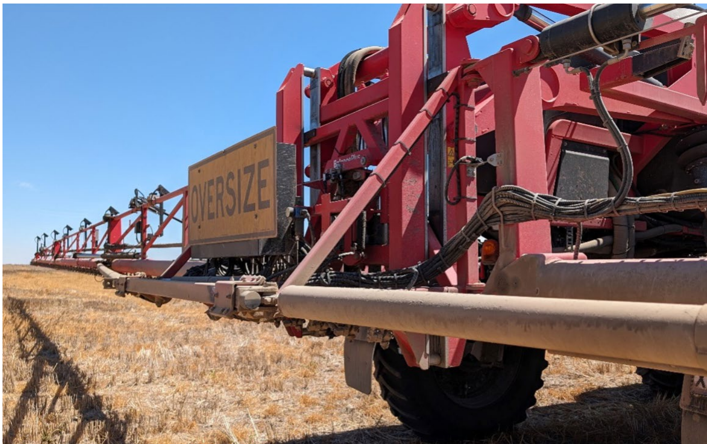
Tim Rethus's 49m Agrifac boom, which is equipped with a Bilberry camera system.

The primary benefit Tim sees in spot spraying is reducing the weed seedbank, which allows more flexibility in crop rotation and the choice of the most economical crop. Tim points out that studies such as those by the Birchip Cropping Group show the value of effective summer weed control in maximising moisture savings in summer fallow, leading to higher yields in water-limited environments.