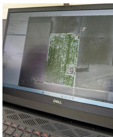
Weeds illustrated in white on the Single Shot map.

The improvements in speed and efficiency have a direct impact on FORM costs. These enhancements underscore the value of integrating advanced technological solutions such as Single Shot into traditional farming operations. By streamlining processes and increasing the precision of applications, Wade has achieved significant cost savings and enhanced the overall sustainability and efficiency of his farming practice.