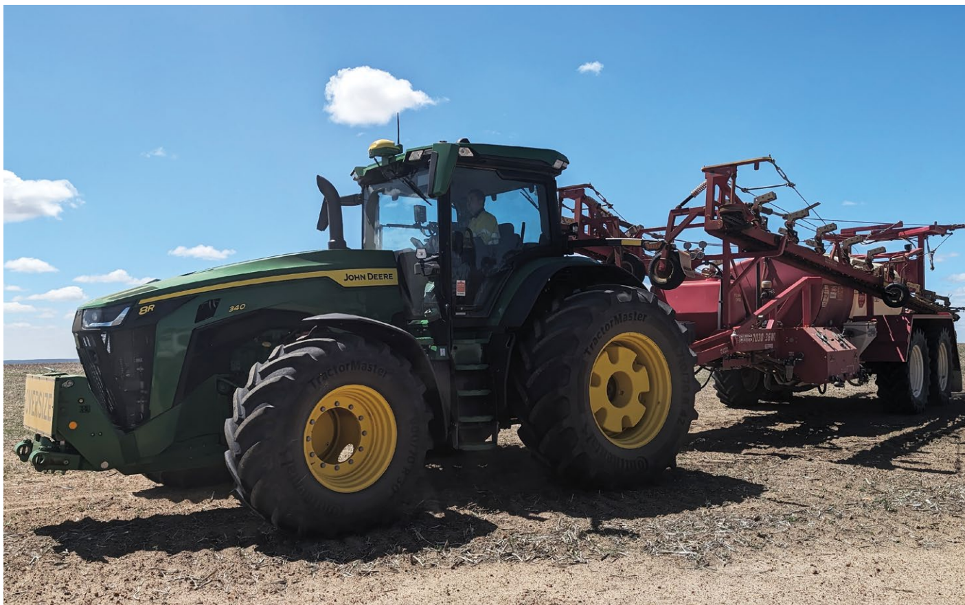
Croplands Sonic WEED-IT system, Warakirri Cropping in Donald, Victoria