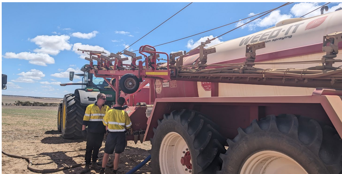
Nurse truck filling Croplands Sonic WEED-IT in Merredin, WA.

Andrew Martin, the manager at Merredin, now plans for three spray passes during the summer fallow period: one blanket spray and two targeted optical sprays for difficult weeds if required. The property uses an automatic rain gauge system to predict weed growth areas, supplemented by scouting to assess weed burden to tailor treatments to specific blocks. This approach has led to significant chemical savings, with some blocks achieving up to an 89 per cent reduction in chemical use.