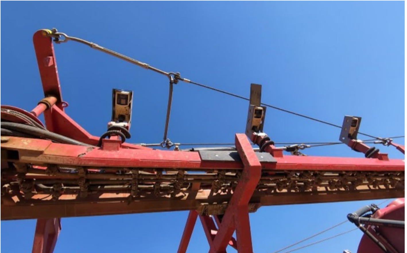
Looking up to the Croplands Sonic boom fitted with WEED-IT sensors.